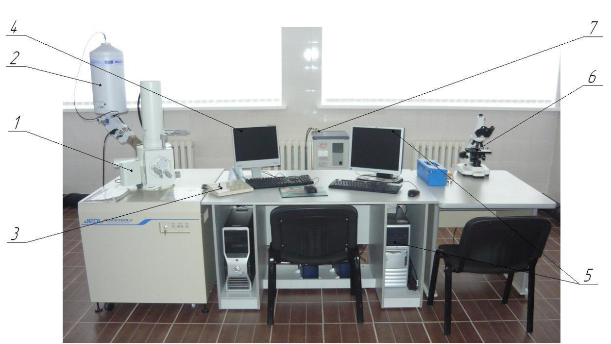
1 – Low vacuum analytical scanning electron microscope «JSM-6390LV JEOL»; 2 – system of X-ray microanalysis «INCA ENERGY 250, OXFORD INSTRUMENTS»: 3 – microscope control panel; 4 – computer for data processing of scanning observation; 5 – computer for data processing of X-ray microanalysis; 6 – binocular microscope "Mikmed-6"; 7 – water cooler.